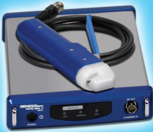
RAPID SEAL II™ SE640 PORTABLE UNIT