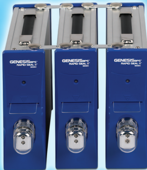
RAPID SEAL II™ SE530 MULTI-HEAD SEALER