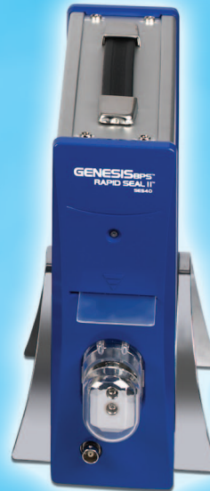
RAPID SEAL II™ SE540 SPACE SAVING BENCHTOP SEALER