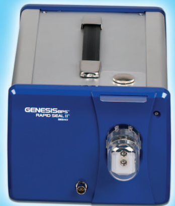
RAPID SEAL II™ SE330 & SE340 STANDARD BENCHTOP UNIT

Component processing is too important to leave to chance.