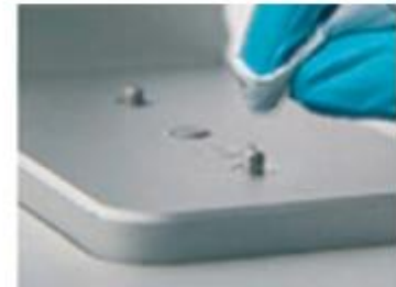
■ quick and easy cleaning