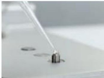
■ Adding sample