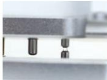
■ Measuring sample