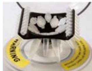
02 CarnisMini-6KS 3-in-1 rotor