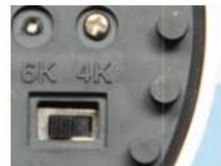
04 CarnisMini-6KC/CarnisMini-6KS /CarnisMini-6KT Two speed options