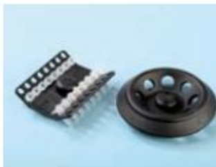
01 CarnisMini-6KC quick release rotor