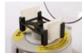
05 CarnisMini-6KT 48-well 50ul PCR plate rotor