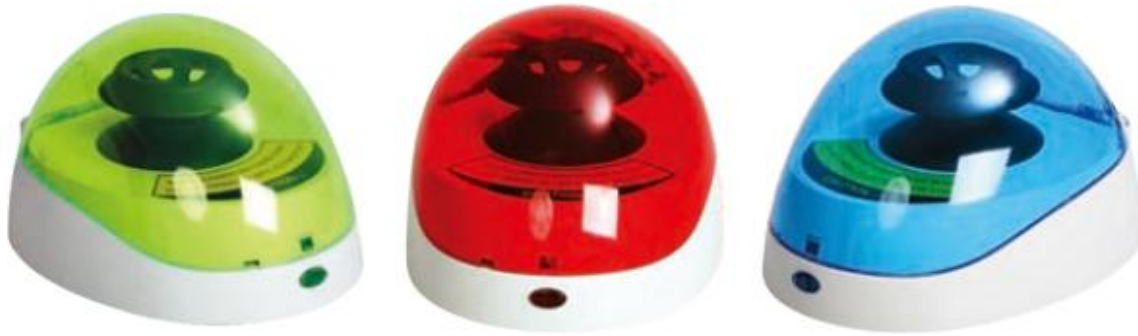
CarnisMini-6K / CarnisMini-7K / CarnisMini-10K